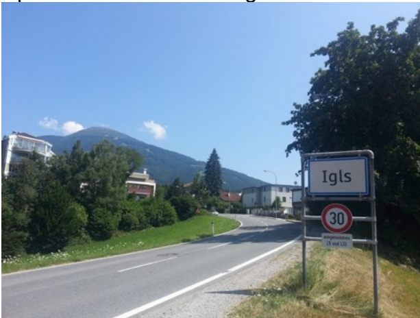
Igls Town Sign

Up the street - to the village VILL and then up to IGLS.